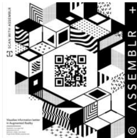
Figure 3. QR code of the Indonesian culture exploration educational game using the application assemblr edu

Students were initially instructed to download the Assemblr Edu application from the Play Store. Subsequently, they were guided to open the educational game using the provided link: https://asblr.com/PGnvP or by scanning the QR code https://asblr.com/PGnvP .