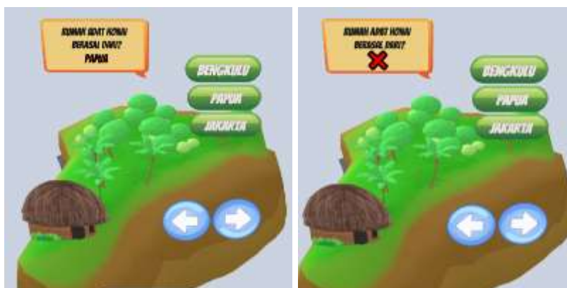
Figure 5. Examples of questions in educational game.

Figure 4. Front page of the educational game with augmented reality Subsequently, students progressed to the next phase, where they responded to various questions related to the diversity of Indonesian cultures.