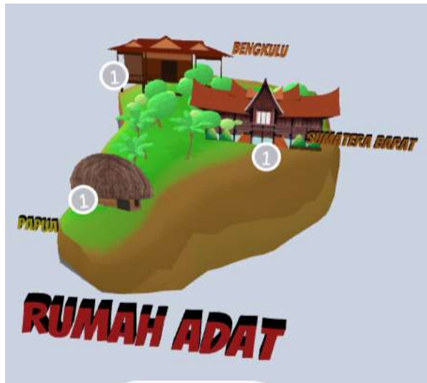
Figure 1. Example of an educational game scene exploring Indonesian culture

enhancing student learning activities, simplifying comprehension of complex learning materials, and presenting practical media for learning, all within an easy-to-operate application (Arena et al., 2022).