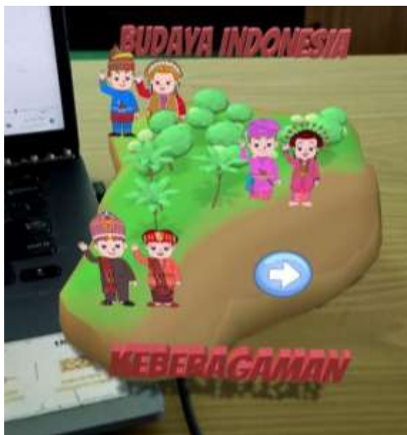
Figure 4. Front page of the educational game with augmented reality Subsequently, students progressed to the next phase, where they responded to various questions related to the diversity of Indonesian cultures.

The students initiated the process by logging into their respective smartphones and engaging with the explanatory pictures provided.