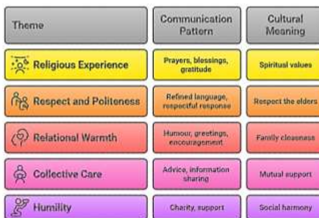
Figure 2. The Thematic In Family Whatsapp Group

The findings show that family WhatsApp groups function as important digital communication spaces where Sundanese cultural values are expressed through routine interaction among family members. Communication activities in the three observed groups were dominated by greetings, prayers, advice, humor, emotional support, and everyday family discussions. These interactions demonstrate that cultural values are communicated through repeated communicative practices embedded in daily conversations. The analysis identified five dominant themes reflecting Sundanese cultural values: religious expression, respect and politeness, relational warmth, honesty and responsibility, and humility. These themes emerged from recurring linguistic expressions and interactional patterns used by family members during everyday communication. Figure 2 presents the thematic findings identified in the family WhatsApp group interactions.