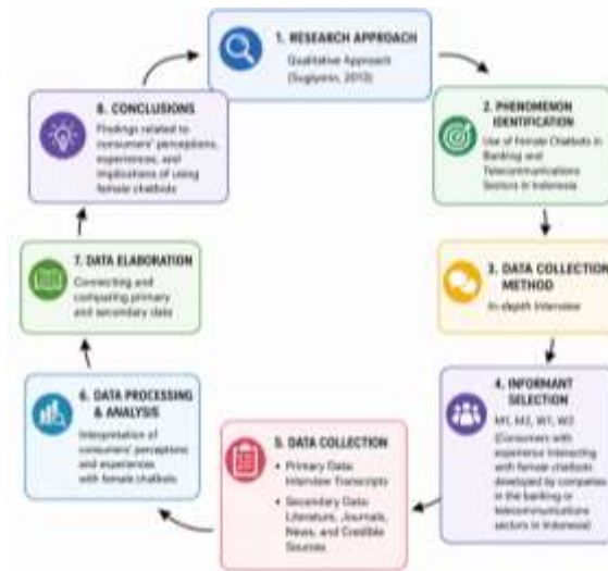
Figure 2. Research Flow

From the in-depth interviews, primary data were obtained in the form of interview transcripts containing the consumers' statements regarding their perceptions and experiences with female chatbots. Meanwhile, secondary data were gathered from literature, journals, and credible news sources. The primary and secondary data were then elaborated upon in the data analysis stage. The results of the data analysis were used to draw conclusions for this study.