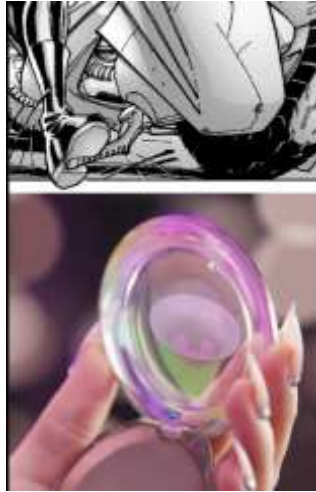
Figure 10. Batman Logo on Compact Powder Collaboration

The dark-colored compact powder with a bat logo is the main point of attention. The shape of the cosmetic product reflects its connection to the realm of beauty, while the bat symbol evokes associations with strength and resilience. The shiny surface of the object creates an exclusive impression, showing a combination of aesthetic function and symbolic power. The contrast between the smooth material of the product and the masculine symbol implies the integration of two images: softness and assertiveness. Through this object, strength is not displayed aggressively, but is integrated into personal identity through everyday objects used by women. In this context, the construction of meaning not only represents visual aesthetics but also reproduces cultural associations regarding masculinity as a symbol of strength and control, which are then integrated into representations of femininity.