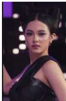
Figure 13. Woman Posing Firmly

The frontal gaze and hand position show the product presents women as representatives of power over symbols. The product is not only displayed, but “controlled” through a gesture of gripping it with a large ring, resembling a weapon accessory. This image depicts that beauty is no longer passive, but ready to face challenges. Women are not only promoting the product, but also demonstrating their authority over it. The relationship between the body and cosmetics is presented as a relationship of power, not dependence. There is no seductive expression, but rather a gaze that establishes distance with the audience. Here, women appear as figures equal to the cold, tough, and unaffected symbol of Batman. The myth that is constructed is that of armed beauty, that owning the product means having symbolic protection, the power to fight in the social arena.