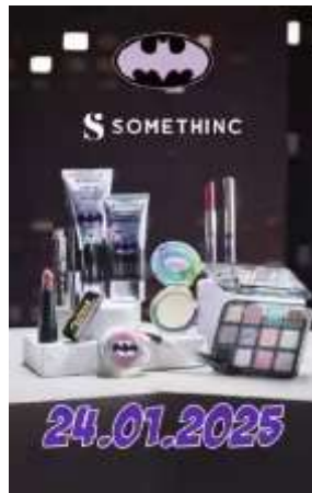
Figure 5. Something x Batman Campaign Closing Frame

face, while soft lighting effects reflect a glow on her skin and the product she is holding. The model holds a compact powder product while staring directly at the camera with a serious and confident expression. Large typographic text that reads “BANG!” appears in dark purple at the front of the frame, reinforcing the dynamic and energetic impression typical of the comic hero style. Visually, the combination of colors, lighting, and body gestures presents an image of a strong, modern, and confident woman.