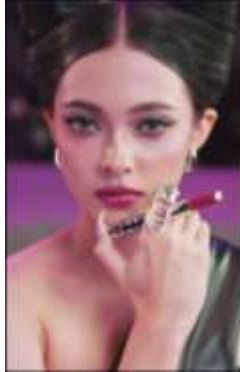
Figure 12. Woman Showing Lipstick Product

The frontal gaze and hand position show the product presents women as representatives of power over symbols. The product is not only displayed, but “controlled” through a gesture of gripping it with a large ring, resembling a weapon accessory. This image depicts that beauty is no longer passive, but ready to face challenges. Women are not only promoting the product, but also demonstrating their authority over it. The relationship between the body and cosmetics is presented as a relationship of power, not dependence. There is no seductive expression, but rather a gaze that establishes distance with the audience. Here, women appear as figures equal to the cold, tough, and unaffected symbol of Batman. The myth that is constructed is that of armed beauty, that owning the product means having symbolic protection, the power to fight in the social arena.