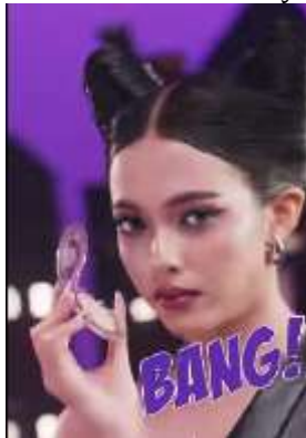
Figure 4. Mid-Frame Model with Superheroic Visual Elements

The opening frame of the reels features a textured gray cement background with a pastel purple Batman logo above the Something logo. This simple visual composition conveys a formal and exclusive impression. The gray color element serves as a neutral background that highlights the logo colors, while the light purple color of the bat symbol gives a soft and modern feel. The even lighting without strong shadows creates a clean and professional tone. Denotatively, this look introduces the brand collaboration's identity, while visually signifying the initial meeting between two symbolic worlds: beauty and heroism.