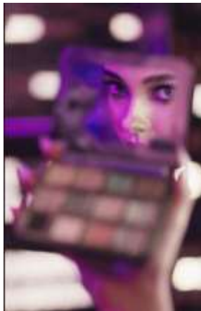
Figure 9. Reflection of a Woman's Face with a Dark Makeup Palette

At the connotative level, visual observations reveal a construction of meaning that combines elements of strength and beauty through the use of color, lighting, and symbols. The dominance of dark colors and purple lighting evokes an impression of both assertiveness and gentleness. Each visual element not only highlights aesthetic aspects but also contributes to building an image of women who are bold, confident, and in control of themselves. In the series of scenes, strength is depicted not through action, but through gazes, symbols, and objects related to self-care.