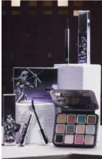
Figure 6. Display of Something x Batman collaboration products

interpretation. The results of the observation show three main visual components, namely the product display, the female figure in a black costume, and the makeup display using the product. The following analysis is based on the visual units identified in each key frame of the Reels, so that each element is systematically analyzed according to Barthes's semiotic stages.