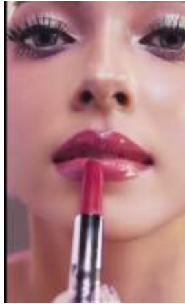
Figure 11. Woman Applying Lipstick

reconstruct the image of women as figures of authority, not merely objects of gaze. In the context of Indonesia's digital culture, this myth reflects the shift in the representation of women from aesthetic objects to subjects who hold authority over their visual identities, while also demonstrating how global symbols like Batman are recontextualized in local branding practices.