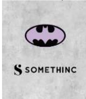
Figure 3. Opening Frame of Something x Batman Reels

segments: the opening, middle, and closing. Each segment has different sign elements, including color, lighting, costumes, text, and object composition, which together form a visual representation of the collaboration between the world of beauty and superhero characters.