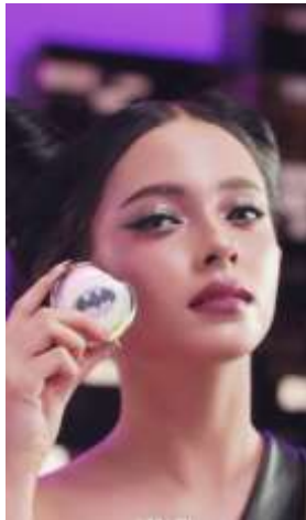
Figure 8. Makeup and Batman-branded products

In photo 5 above, a woman is seen wearing black synthetic leather clothing with an asymmetrical cut and one open shoulder. Her hair is styled high into two rolls resembling cat ears. The background shows purple and golden city lights. The model stands upright, facing the camera, without a smile. The light from the left creates a shine on her skin and clothes, highlighting the texture of the fabric. There are no noticeable gestures or body movements, with a stable and upright body position. The frame composition shows the female figure with contrasting lighting in the middle of the nighttime visual atmosphere.