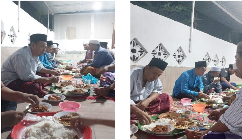
Figure 5. The Roah Umrah procession in Sasak tradition

Roah Umrah is a family thanksgiving event held in response to Allah call for prospective Umrah pilgrims who will soon undertake the pilgrimage to the holy city of Mecca. Roah Umrah is not merely a feasting tradition for the Sasak community of Lombok, but it also embodies deep religious and social values (Usman, 2023). The practice of communal meals is further emphasized by the teachings of the Prophet Muhammad (peace be upon him).