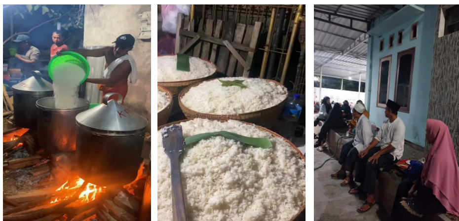
Figure 4. The Begaue Blessing Ceremony in Sasak Tradition

The begaue tradition represents one of the cultural treasures of the Sasak community in Lombok, rich in social, cultural, and spiritual values. This tradition serves not only as a reflection of local wisdom but also as a tangible manifestation of solidarity, communal harmony, and deep reverence for ancestral heritage, which continues to be upheld by the Sasak people.