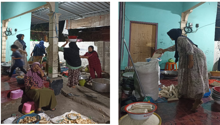
Figure 3. Belangar Process in Sasak Roah Umrah Tradition

Belangar or local community members contribute rice to the host ( epen gawe ) who will be organizing the roah umrah ceremony as shown in Figure 3. The host then gathers all the necessary ingredients, including rice, jackfruit ( jukut nangke ), banana stems ( jukut ares ), eggs, chicken, and meat, along with the distinctive spices of Lombok Sasak cuisine. All these items are intended for the consumption ( dulang ) that will be served during the roah umrah ceremony