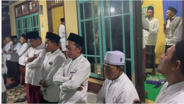
Figure 2. The Selakaran Ceremony of the Sasak Umrah Tradition