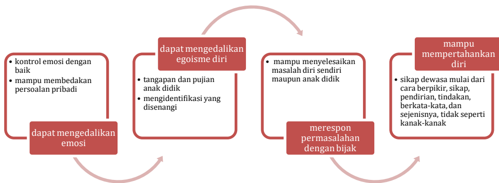
Figure 2. And emotional control

Teacher performance must refer to the competencies they have according to the areas they control, including the work capacity of each individual which includes knowledge, skills and work attitudes that are by following perunder the expected standards.