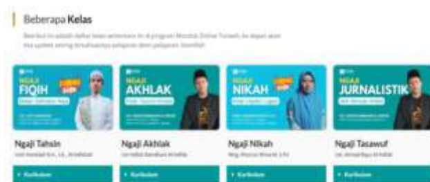
Figure 6. Online Mondok Features

Reporting from the Pesantren Tsirwah Digital application page, in the online boarding feature there are several class options that can be accessed by users. Such as the Taisirul Kholaq Book of Moral Recitation class and also journalism recitation. However, there are also several classes that are still coming soon or coming soon. Such as the Koran Fiqh class, the book Matan Safinatun Naja and the Koran Nikah book, Uqudul Lujjain . Users can follow the Koran until they understand and understand the details of the price that must be paid. The duration of online accommodation is around 6-8 months. Then the process of delivering the material is carried out through the Google Meeting room