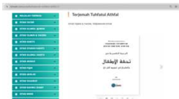
Figure 4. Digital Translation of the Tuhfatul Athfal Book on the Digital Islamic Boarding School Tsirwah Application

It can be concluded that, the library features that contain the digital Tsirwah library are specifically for ease of access, speed of searching and being able to navigate pages. Apart from that, it also gives a unique and sophisticated impression, because users can read PDF books with an experience like reading a book in the real world. The digital Tsirwah library can be accessed easily via the following link: http://tsirwah.com/perpustakaan-digital