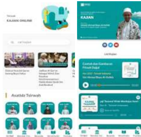
Figure 5. Online Study Features