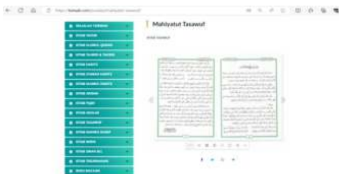
Figure 3. Digital Mahiyatul Sufism Book on the Digital Islamic Boarding School Tsirwah Application

In theory, according to Muhammad Yasin Fatchul Barry, the development of digital literacy of yellow books makes a positive contribution to improving the ability of students to study yellow books (Barry, 2020, p. 97). The Tsirwah Digital Library is designed to be a central collection of yellow books and PDF reading books. The Tsirwah Digital Islamic Boarding School completes its library with popular yellow books, among these popular books include: 1) Sufism books, such as Mahiyatul Tashowwuf, Bidayatul Hidayah; 2) Fiqh books, such as Bughyatul Mustarsyidin, Tadzkirah Hadromiyah, Fathul Qarib, Safinatun Najah, Fathul Mu'in; 3) books of faith, such as Aqidatul Layman; 4) wirid books, such as Syarah Burdah; 5) Tajwid books, such as Tuhfatul Athfal.