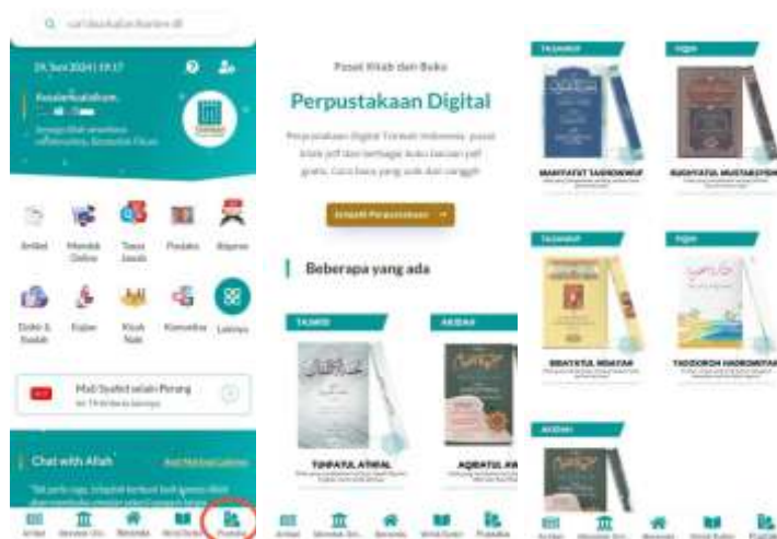
Figure 2. Library Features

The focus of the study in this discussion is library features. The library feature in the Tsirwah Pesantren Digital application is a digital library center. It contains various books in PDF (Portable Document Format) form and also various reading books that can be accessed for free by users. This Tsirwah digital library feature is a means of convenience for every Muslim. Especially for anyone who wants to look for various yellow books, of course from sources that have clear scientific background. Asatidz at Tsirwah are graduates of various Islamic boarding schools in Indonesia, because the founders of Tsirwah took into account scientific originality(Ramdhani, 2024b).